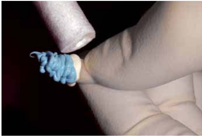
2 Remove excess cement once implant restoration is completely seated onto VPS abutment.

completely onto the abutment to facilitate the adaptation of the PTFE tape to the intaglio surface of the implant restoration.